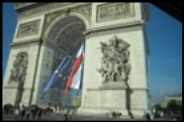
← Arc de Triomphe